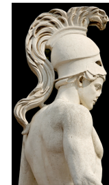
Ares / Mars God of war