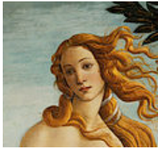
Aphrodite / Venus Goddess of love.