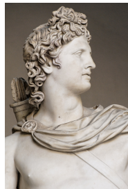
Apollo / Apollo God of the sun and poetry