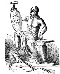
Hephaestus / Vulcan God of fire and the forge.