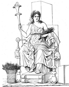
Demeter / Ceres Goddess of agriculture. Think, "cereal."