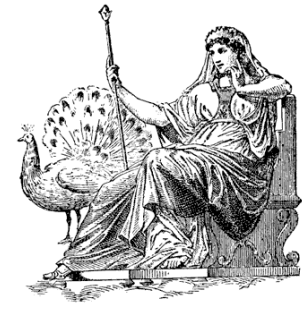
Hera / Juno Goddess of marriage and family.