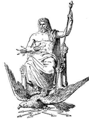
Zeus / Jupiter King of the gods. God of thunder.