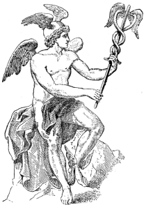
Hermes / Mercury Messenger of the gods. God of business and thieves.