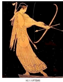
Artemis / Diana Goddess of the moon and the hunt