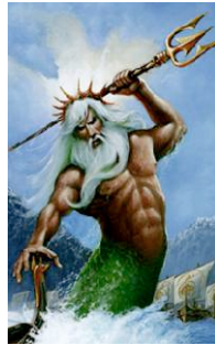
Poseidon / Neptune God of the sea.